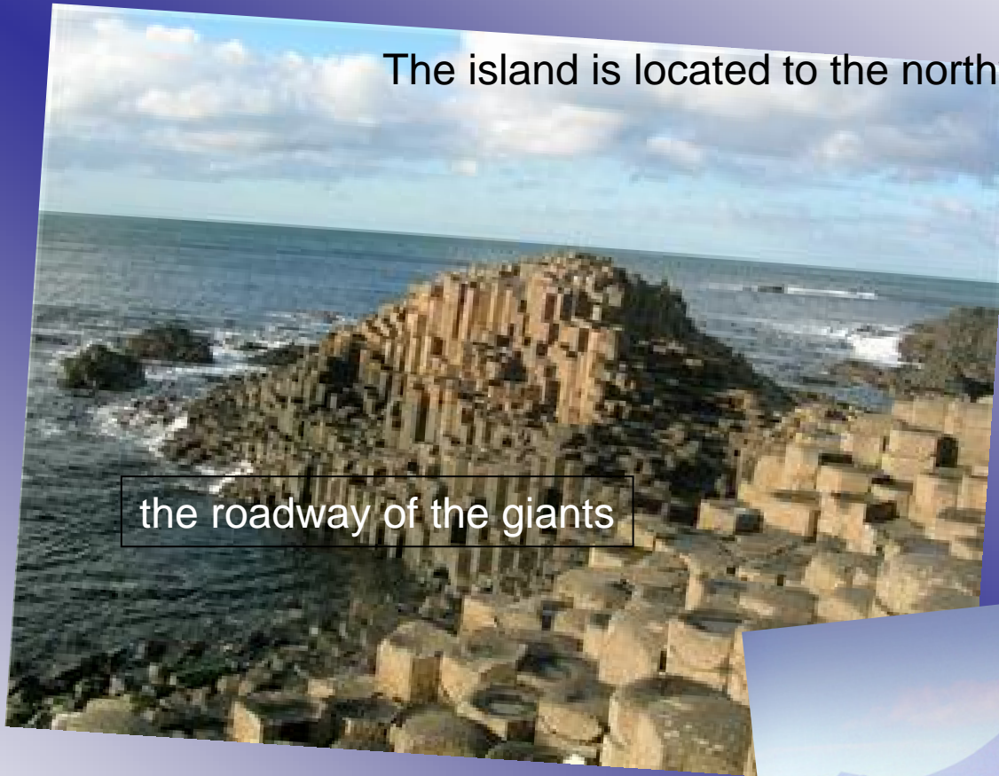
the roadway of the giants

The island is located to the northwest of Europe